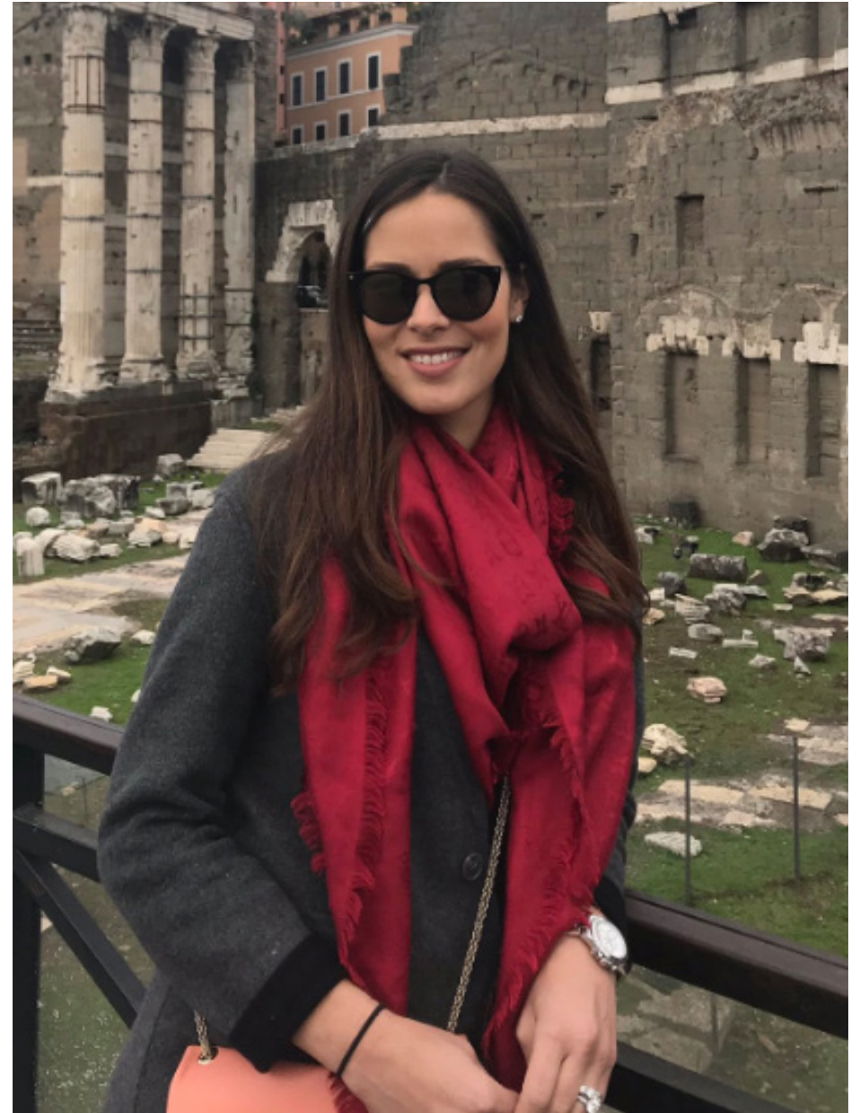
ANA IVANOVIC Former Serbian tennis player Glasses: DESNA