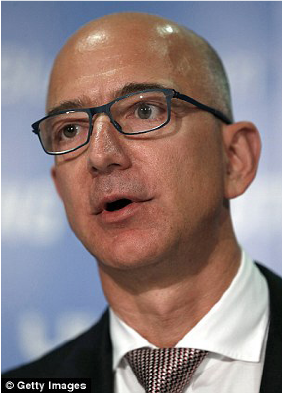
JEFF BEZOS Founder of Amazon Glasses: GENE