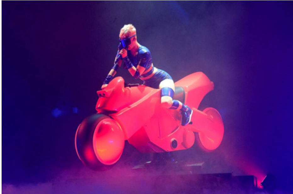
KATY PERRY US-American singer Glasses: DAISUKÉ