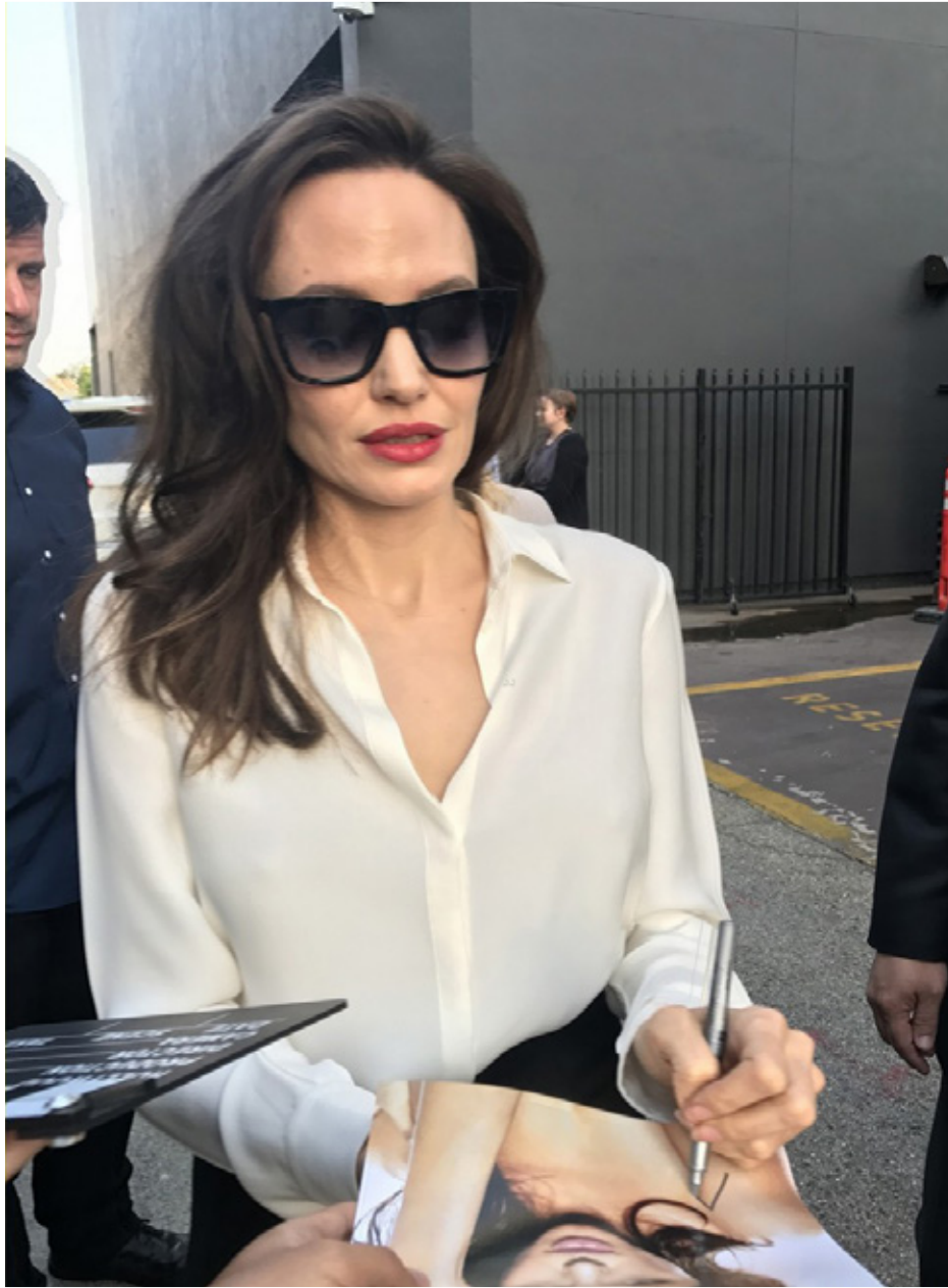
ANGELINA JOLIE US-American actress Glasses: STUDIO 3.2