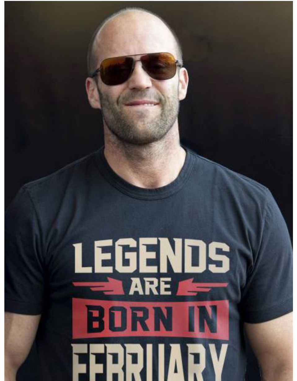
JASON STATHAM British actor Glasses: ROLF