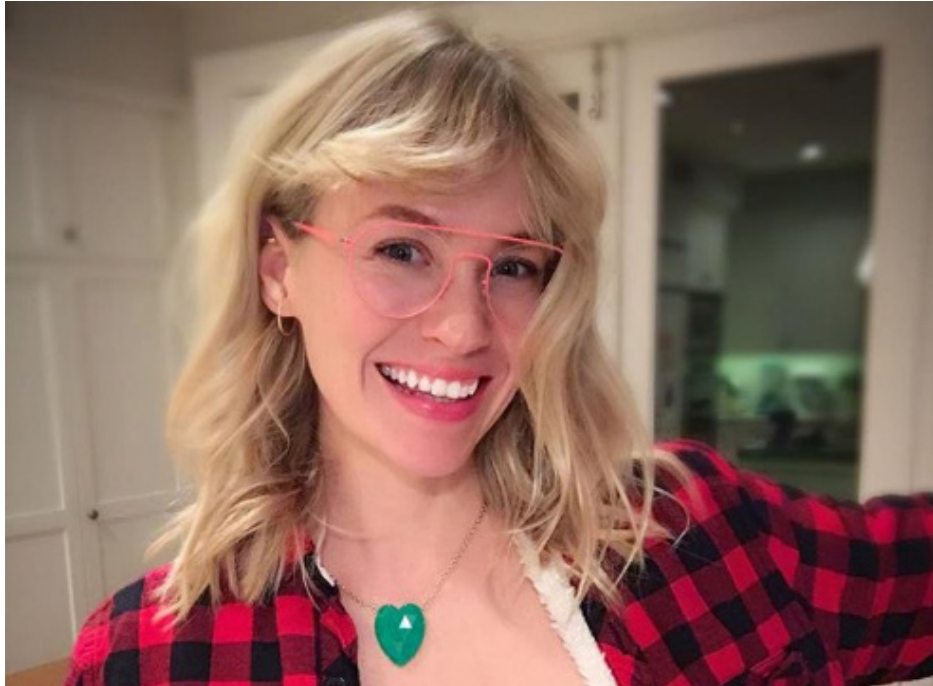
JANUARY JONES US-American actress Glasses: MINTTU