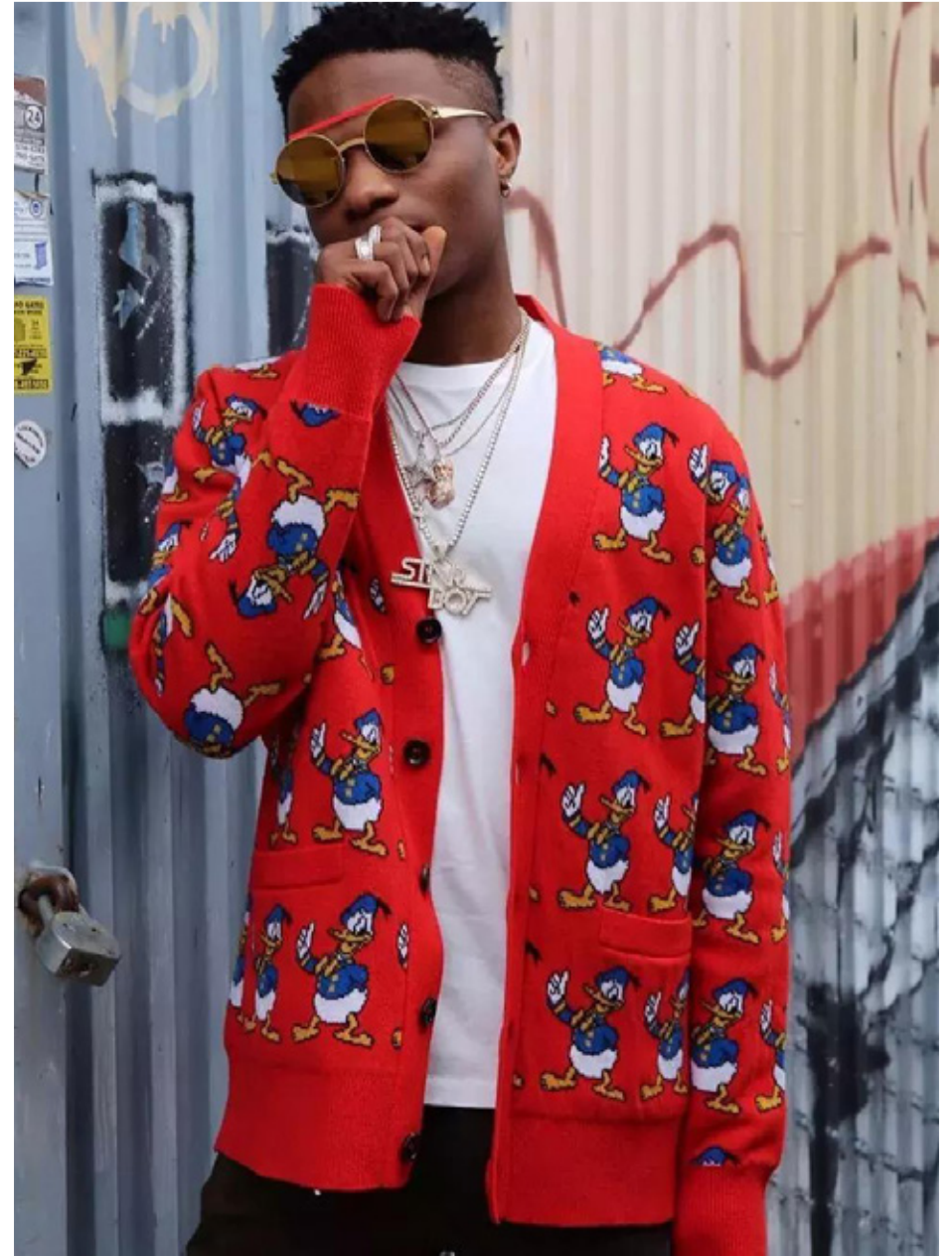
WIZKID Nigerian musician Glasses: VERBAL