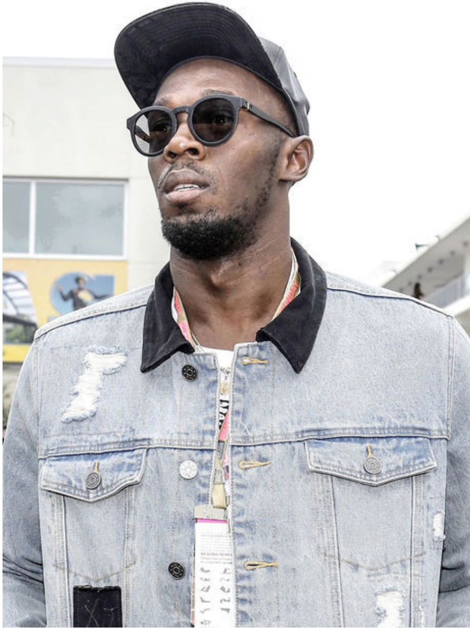
USAIN BOLT Jamaican athlete Glasses: GIBA