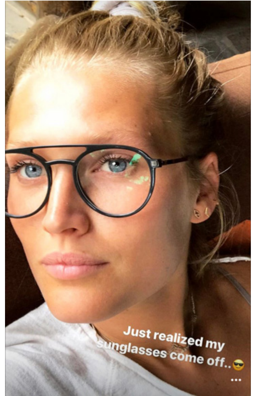
TONI GARRN German model Glasses: MIKI