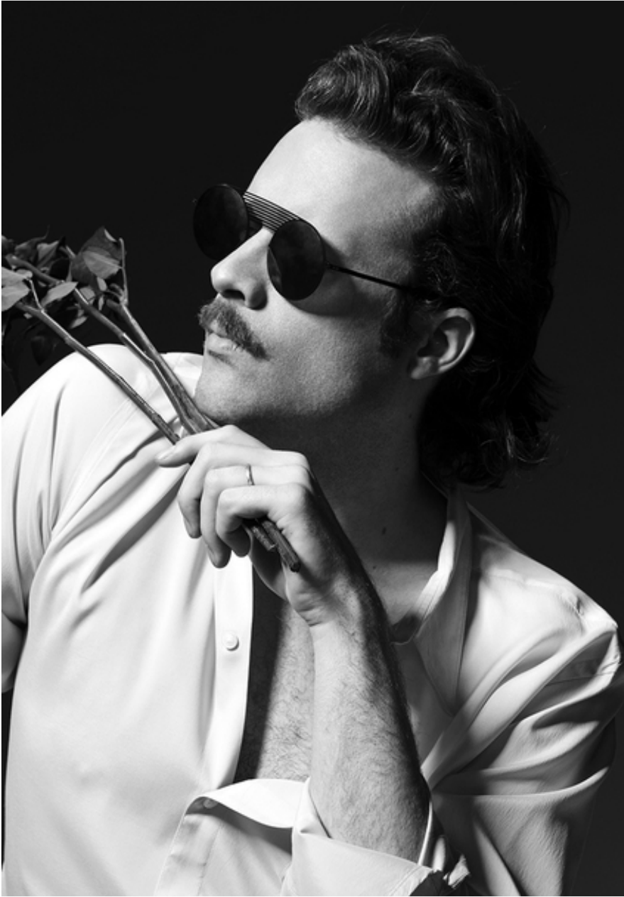
FATHER JOHN MISTY Us-American musician Glasses: STUDIO1.2