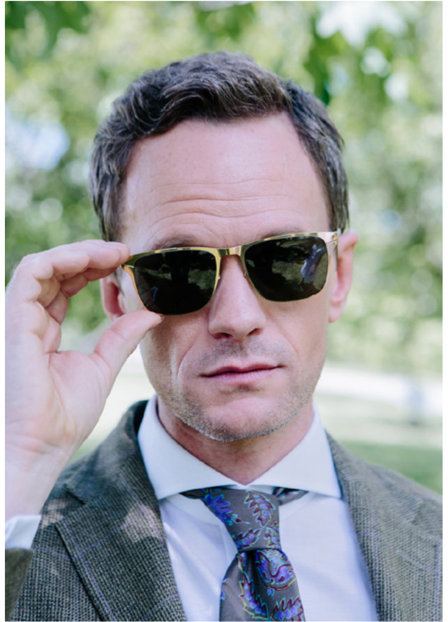
NEIL PATRICK HARRIS US-American actor Glasses: KUBICK