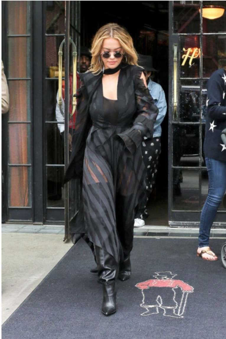
RITA ORA US-American singer Glasses: SIRU