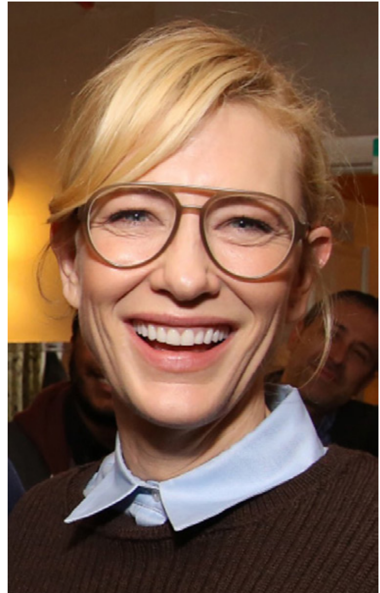
CATE BLANCHETT Australian actress Glasses: FRIDO