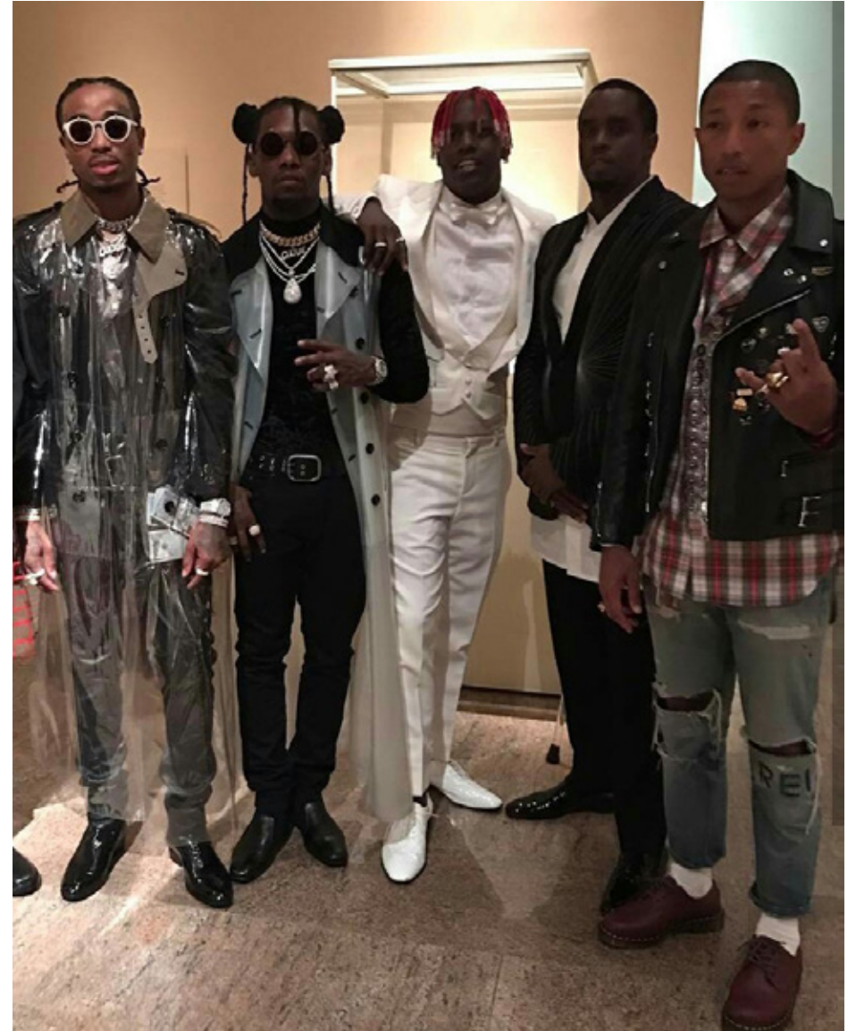
QUAVO AND OFFSET Members of hip hop trio MIGOS Glasses: BRADFIELD/FEDOR