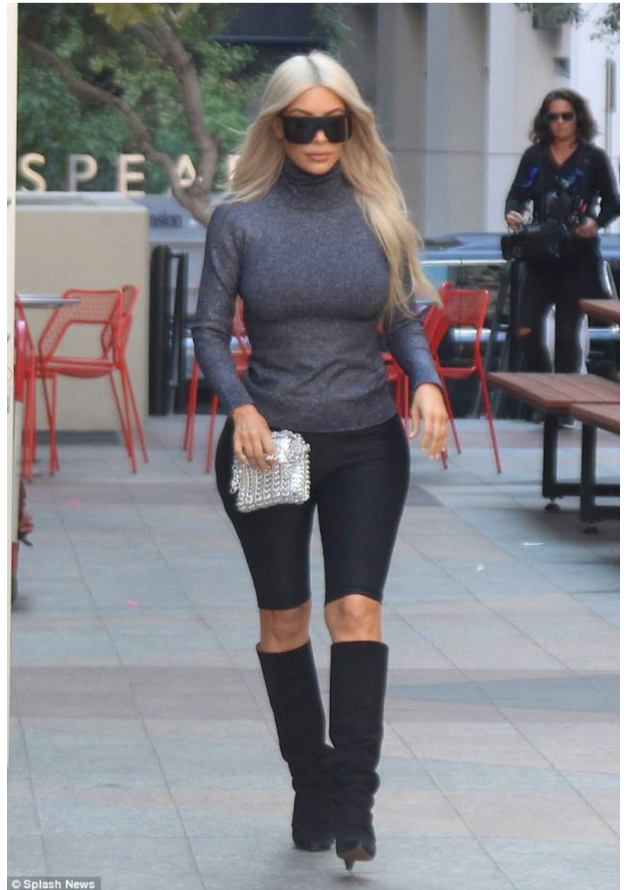
KIM KARDASHIAN US-American entrepreneur and model Glasses: TRUST