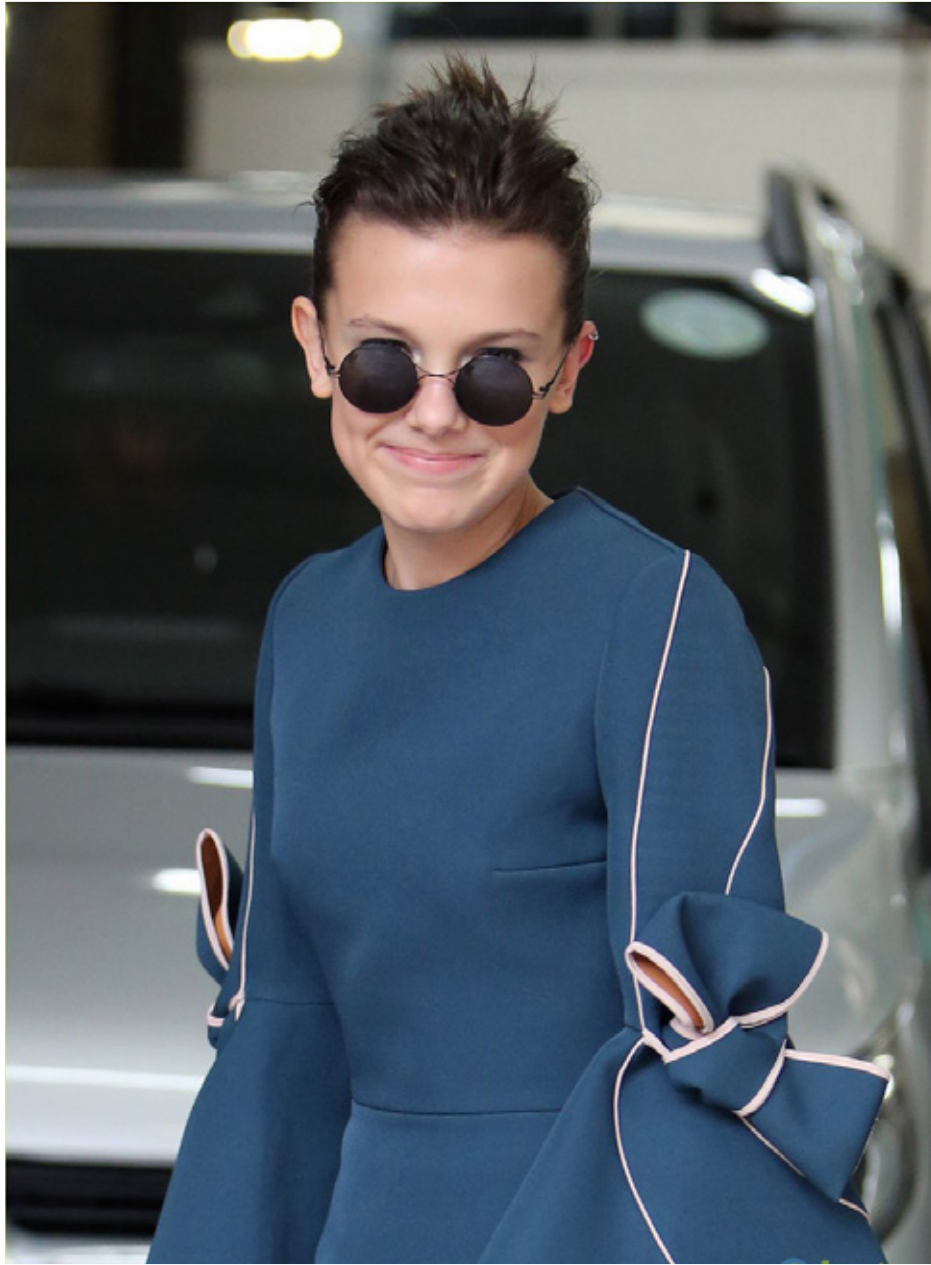
MILLIE BOBBY BROWN British actress Glasses: MMESSE002