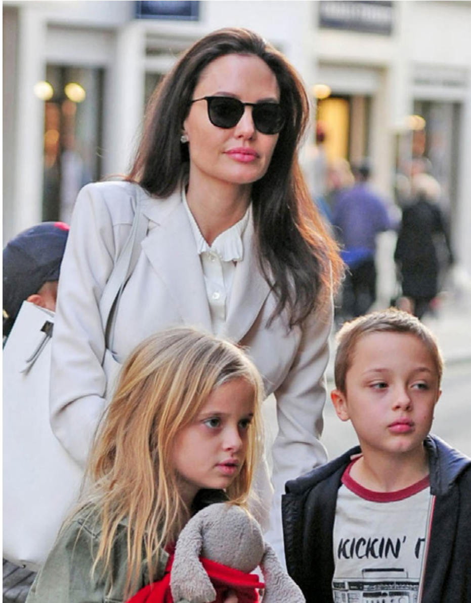
ANGELINA JOLIE US-American actress Glasses: ESKA