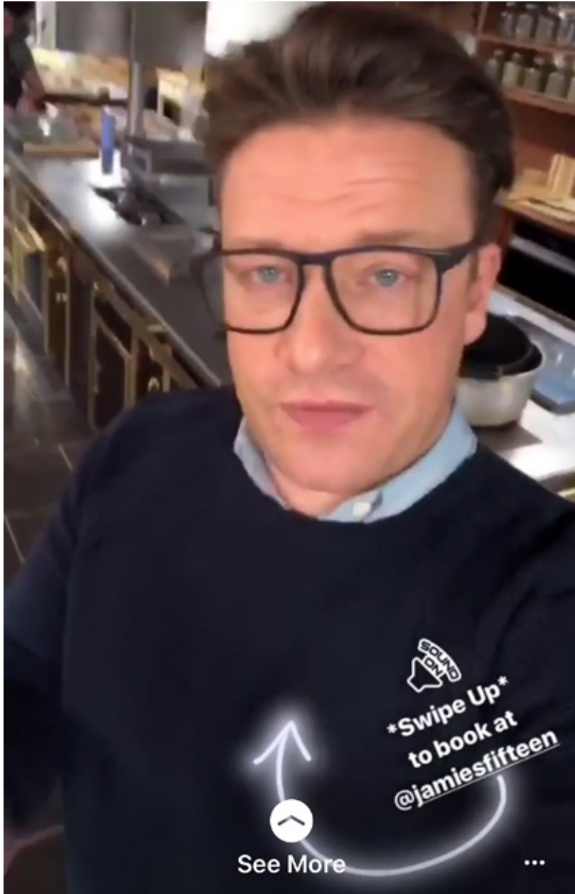
JAMIE OLIVER British celebrity chef Glasses: MAHI