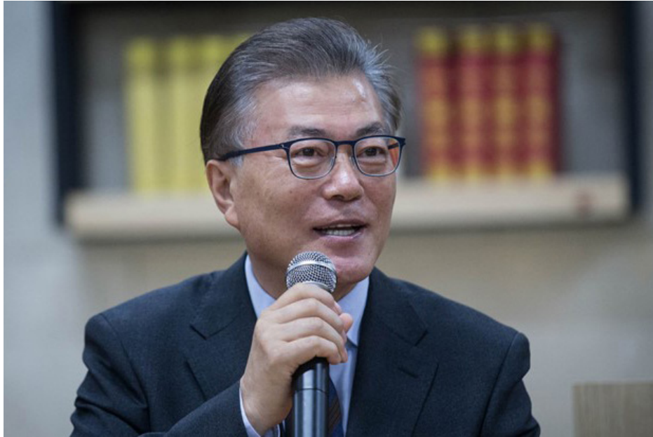
MOON JAE-IN President of South Korea Glasses: KAI