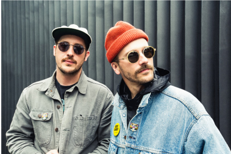
PORTUGAL. THE MAN US-American indie rock band Glasses: GIANNI/GIGI & GIGI SHADES